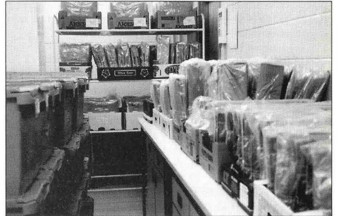
Figure 4. Bundles of specimens transferred to cardboard trays in the 'holding area' prior to freezing.

hours. The polythene coverings were then removed, and the specimens re-stored in their respective bundles in the cardboard crates for at least 48 hours before being shelved in the cabinets (cf. Figure 6). During the re-shelving, a more detailed inventory of the specimens was compiled, which was checked against the original made in the Baines Wing. All cardboard generic covers were replaced and relabelled with the appropriate family and generic numbers and names. In addition, most of the original flimsies enclosing the individual specimens were trimmed to remove the torn and dirty edges; many were completely replaced (cf. Figures 7 & 8).