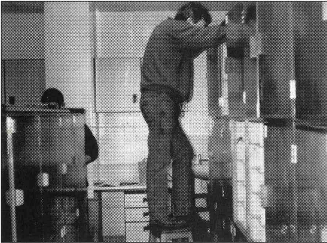
Figure 5. Carpenters refitting the herbarium cabinets in the new building.