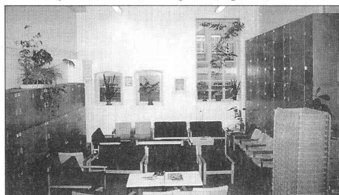
Figure 1. Before the move: the herbarium cabinets lining the walls of the tea-room in the Baines Wing.

The bundles of wrapped specimens were transferred to carefully numbered crates (Figure 3), which were transported to a 'holding' area in the basement of the new building where they were stored until required (Figure 4). The