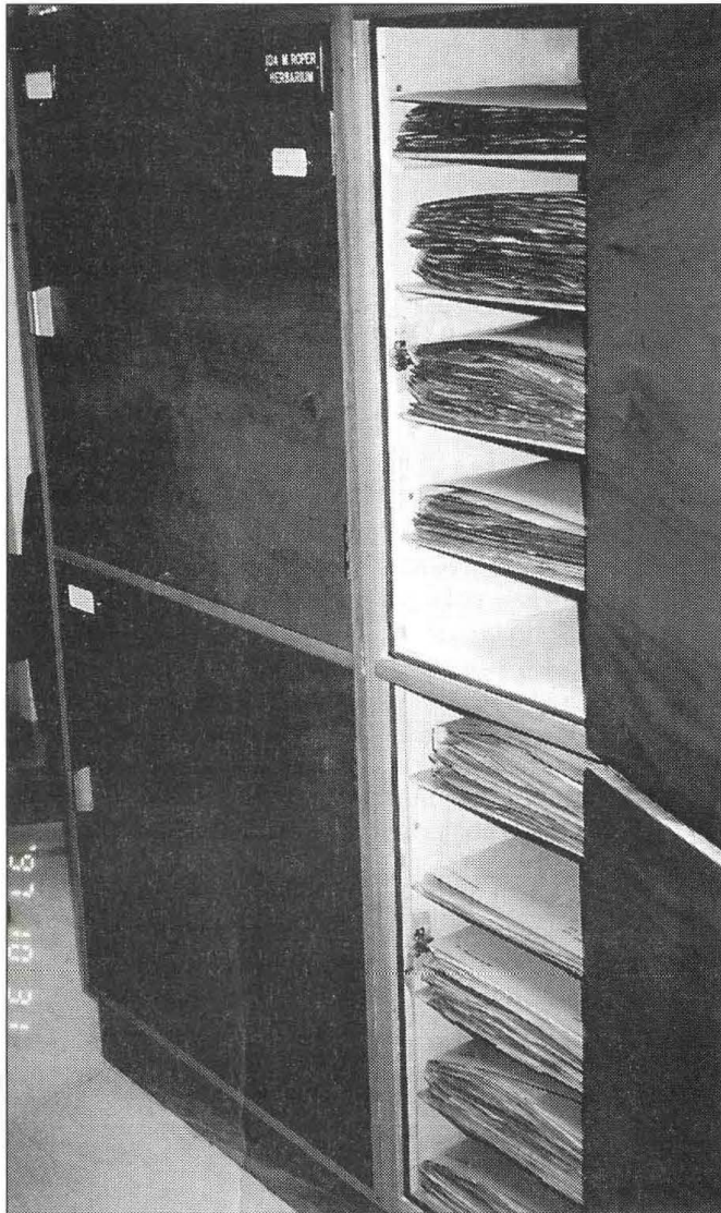
Figure 7. Part of the reinstated Ida Roper Herbarium, showing the new generic covers and appropriate labelling.

The lichen collections now occupy some 80 shelves in eight cabinets.