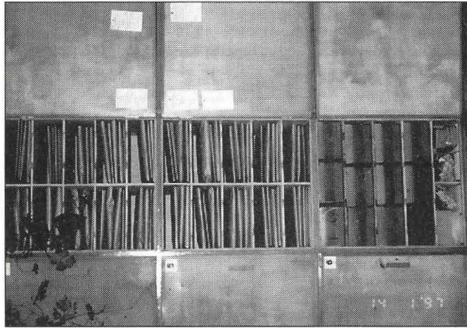
Figure 2. Some of the William Ingham bryophyte specimens and old moss boxes in situ before the move.