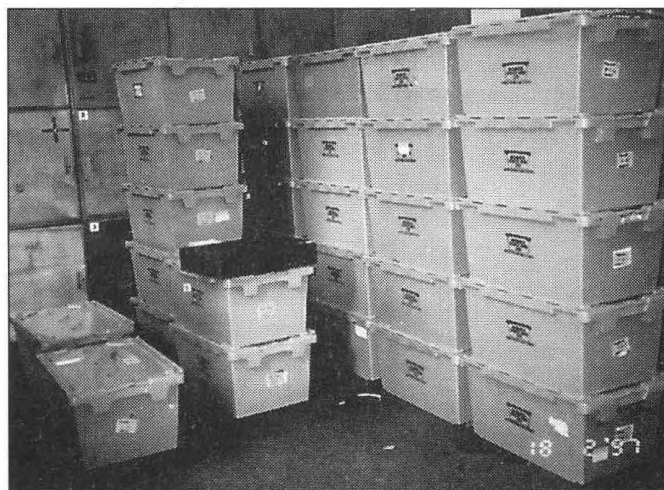
Figure 3. Crated bundles of wrapped and labelled specimens waiting to be moved to the new building.

From April 1997 to April 1998 the entire herbarium was gradually frozen and re-housed in the cleaned cabinets. A routine procedure was established, during which the polythene-wrapped specimens were transferred from the storage crates into cardboard trays, which were loaded onto a large trolley which could be wheeled in and out of the walk-in freezer as required (cf. Figure 4). The specimens were all frozen at a temperature of -18 C for at least 72 hours, brought up to ambient temperature over a period of 8 hours and then refrozen for a further minimum period of 72 hours. They were then transferred to the herbarium, and allowed to reach ambient temperature over a period of approximately 7