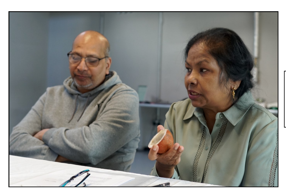
Figure 4. This participant explains how coconuts are an integral part of wedding ceremonies in Pakistan.

Several participants further discussed the practice of offering food before you eat. In this sense, one workshop participant reflected "all of these things" could be used in ritual. As the Hare Krishna participant explained, the boundary between food and ritual is permeable. For some people, there are exclusions of plants as well as inclusion. Alliums for example are excluded from the Hare Krishna diet since they are considered too stimulating.