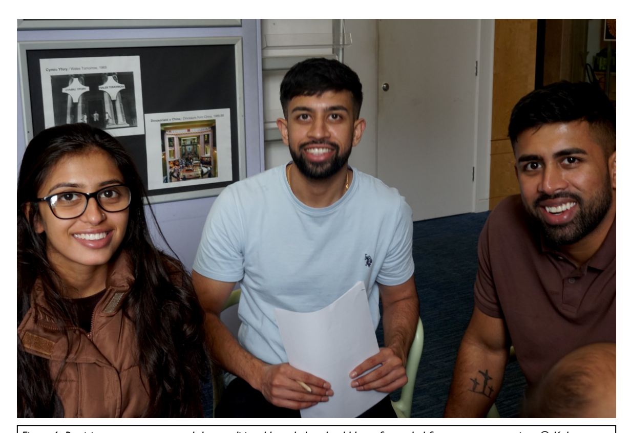
Figure 6. Participants were concerned that traditional knowledge should be safeguarded for younger generations © Kalþana Tagore 2022.

Many members of the workshops expressed concern about the potential loss of bio-cultural knowledge held within the community, including of traditional plant remedies. Several elders of the community, who had learnt about the beneficial properties of specific plants while growing up in India or Pakistan were anxious that this knowledge might be lost to younger generations of the community, born or growing up in Britain, who may not have the opportunity to spend time in