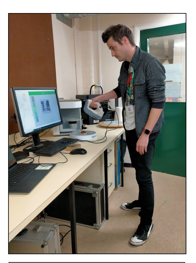
Figure 3. Creating three-dimensional images of South Asian specimens.

Initially 2D images were created using a high