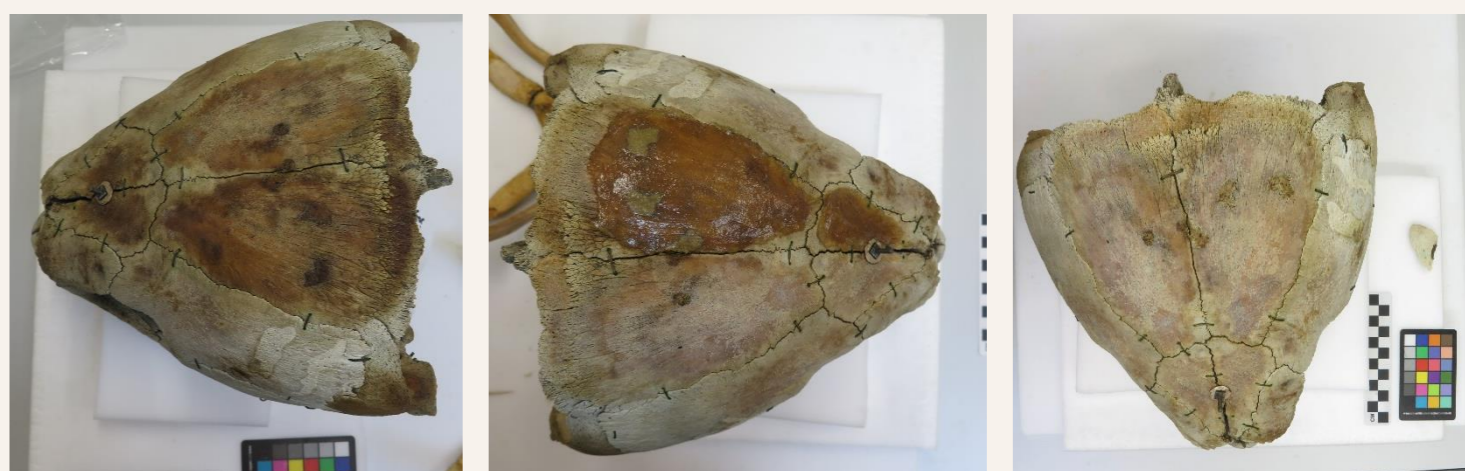
Before, during and after the application of Laponite RD solvent gel to reduce the fat staining on the skull.

Laponite is a clay based synthetic silicate. The presence of sodium, silicon magnesium and lithium within its structure make it an ionic gelling agent that introduces a slightly alkaline pH to the gelling system (Warda, et al., 2007). Laponite will gel at a concentration of 5% with water or at lower concentrations with the addition of a salt.