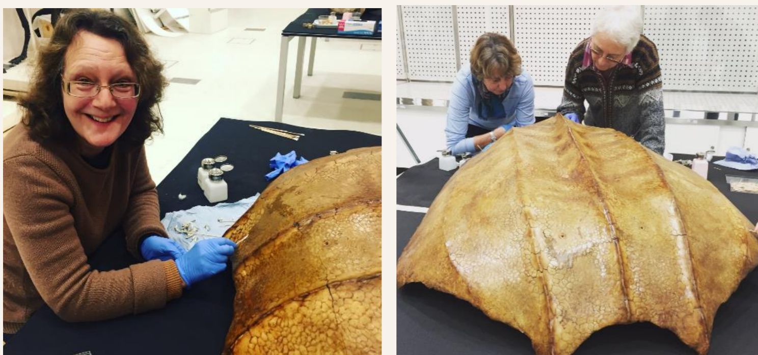
Our fantastic volunteers swab cleaning the scutes of the carapace.

The fat staining on the porous bone of the skull and vertebrae was reduced through the use of Synperonic A7 suspended in Laponite gel.