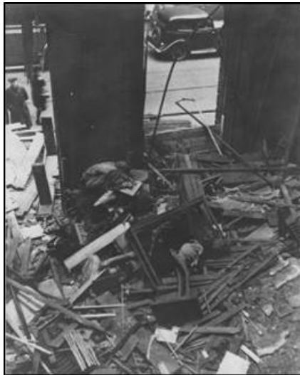
1941 Bomb damage to City Museum on Park Row

The displays were traditional type, very specimen rich and a mixture of skeletal, mounted and preserved specimens. The Museum was extended in the 1860s and the quality and quantity of the collections expanded to form the basis of the Designated Natural History collections Leeds Museums and Galleries holds today. The Museum continued until 1941 when it was badly bombed, and many valuable specimens were completely destroyed, according to eyewitnesses mummy remains were blown onto the street by the force of the bomb. Part of the original building was demolished and the rest was heavily shored up with a cement-rendered wall. Even so it enjoyed a huge post war renaissance, with such successful activities as a Saturday children's club.