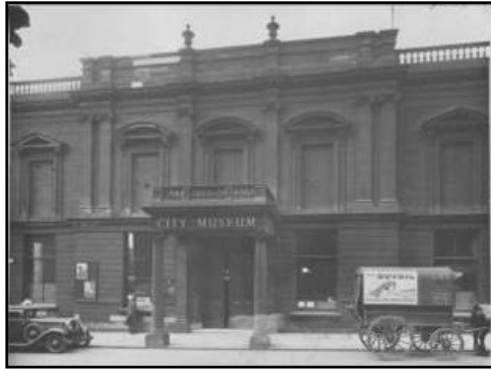
City Museum on Park Row

Natural History Collections on display have a long history in Leeds. The origins of the City Museum can be traced back into the 1770s, but the first purpose built Museum was opened in this fabulous building in 1821 on Park Row by the Leeds Philosophical and Literary Society.