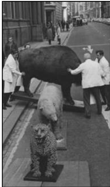
1966 Collections move