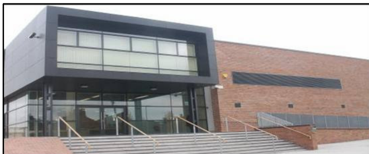
Leeds Museums Discovery Centre

The storage block is extremely functional, basically a large extremely secure concrete box, with full environment control set for objects, not necessarily for the comfort of staff and visitors. The store was designed to provide maximum visual impact and accessibility in one space, and for us to be able to easily get objects out for researchers, school groups, community groups, in fact any potential user.