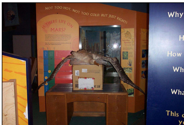
Fig 2. A stuffed albertros.

The paper will address the history of taxidermy and its display in museums (Fig 2.). Potential conservation issues surrounding the control of relative humidity, light, pests and dust, on openly displayed specimens, shall be the main focus of the paper and the plausibility of maintaining a constant supply of replaceable specimens will be addressed i.e. will the supply meet the demand when specimens begin to look worn? Do museums budget for the replacement of specimens? Are there enough taxidermists employed by museums today?