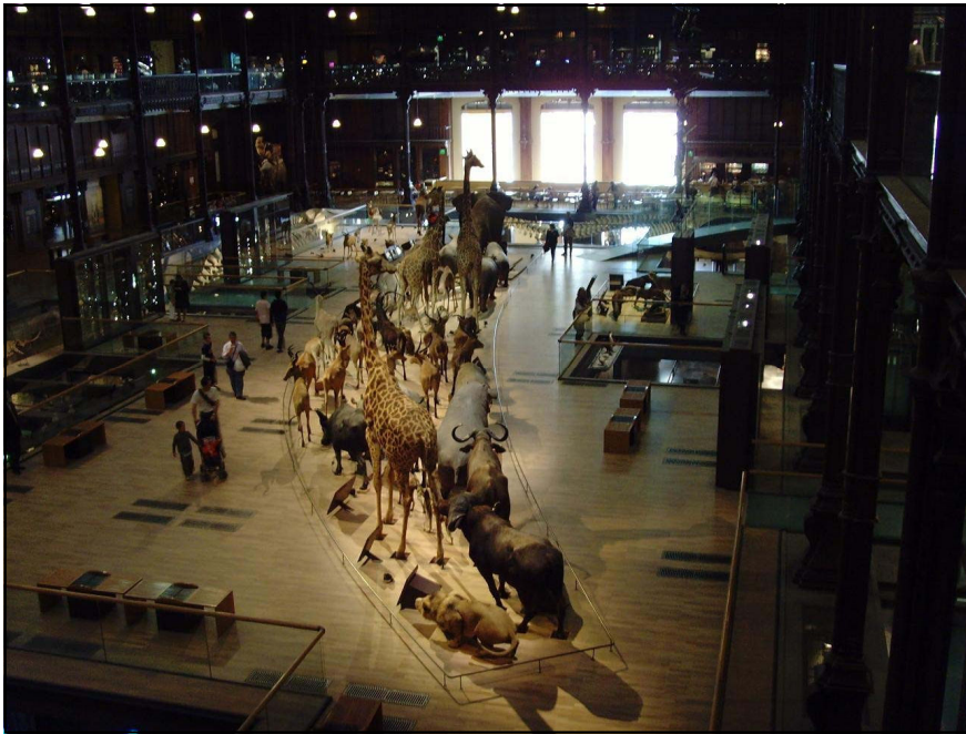
Fig 3. The 'stampeed' at Kelvingrove Museum. Displaying these large mounted animals in one of the main galleries allows people to see the real size and the detail of the specimens

If anyone has any thoughts, or contributions to my research, please get in touch!