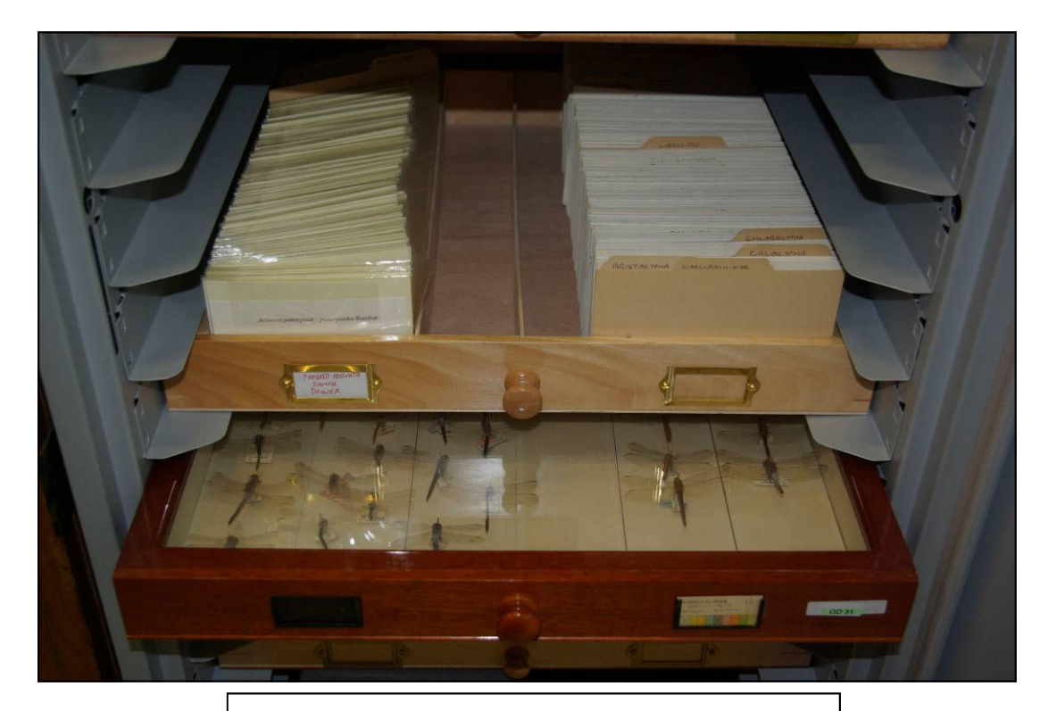
Fig. 6. The new drawer in situ in new C & D Type A cabinet associated with main pinned collection drawer.

We ordered 60 drawers to house the whole Odonata papered collection and an additional 30 to store small jars of Diptera material, so the design is useful for other purposes. The narrow width of the front and back of the drawer meant that the drawer knob would only be able to have a shallow hole for glue fixing knob reinforced with an angled fixing nail. However by using more than usual of the PVA glue, the knob should hold firm. Use of these compatible drawers can now enable us to bring together the whole dry Odonata collection in one series, for the first time in the collection's history (Fig 6).