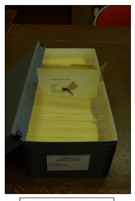
Fig. 3. In 'postcard storage' box.

are made of 1.25mm thick non-static, chemically inert, Polypropylene plastic envelopes 153 mm x 82 mm. (product number 1130DP) with supporting carrier backing card of Perma/Dur® Folder Stock from Preservation Equipment Ltd. We buy sheets of 406 x 508mm of the latter (Product number 750-1620) and cut these into 120 x 80mm rectangles to fit the envelopes. Label paper used is 100% rag from BioQuip with printed script using a Hewlett Packard 1100 LaserJet printer. Within the envelope we have a sandwich consisting of, from front to back, the specimen, the new label, the backing card and old labels. The heat sealer for the Polypropylene envelopes ensures that no fragments will be lost and we use the model supplied by Preservation Equipment Ltd. We had begun to store these into Archival quality buffered and acid free 1300 gm Perma/Dur® 'postcard storage' boxes from Preservation Equipment Ltd (product number 780-4612) in non pest-proof metal cupboards kept near the main collection but not directly associated with it (Figs 3 & 4).