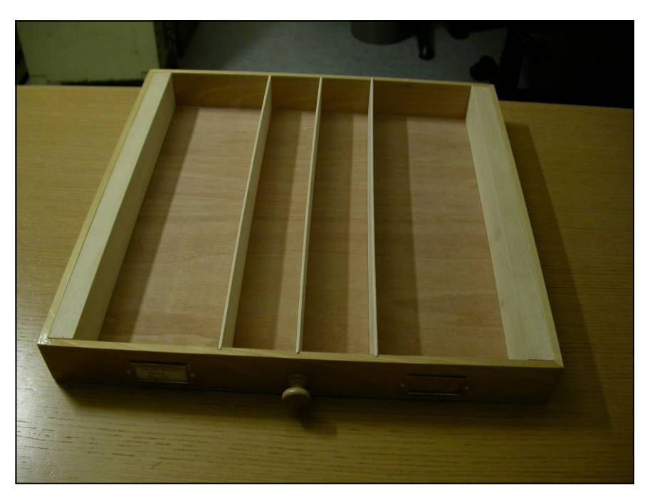
Fig. 5. The new Papered Odonata collection drawer.

The drawers have three slots in the front and back drawer frame for the three 3mm wide removable dividers per drawer. The design includes two wooden outer side packer blocks to keep the envelopes protruding above the drawer from snagging the two empty unused C & D cabinet runners above, at 20mm in from the internal edge on each side (Fig 5).