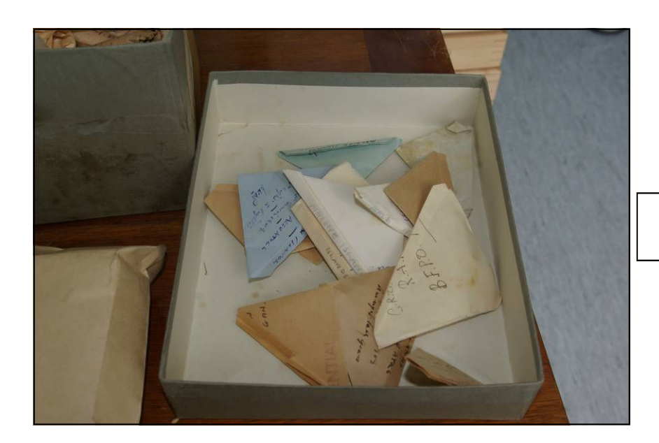
Fig. 1. Chaotic papered collection.

Insect papered collections have often been considered the least accessible specimens in any Entomology collection. Unset specimens have been placed, into non – archival quality newspaper or blotting paper triangles and square paper envelopes, hopefully with collecting and locality details and then placed chaotically into old cardboard cartons, biscuit tins and shoe boxes of similarly non - archival quality. Initially meant as temporary storage, the specimens might have been forgotten about or put to one side for some future date when time might be devoted to the relaxing and pinning of such specimens (Fig 1).