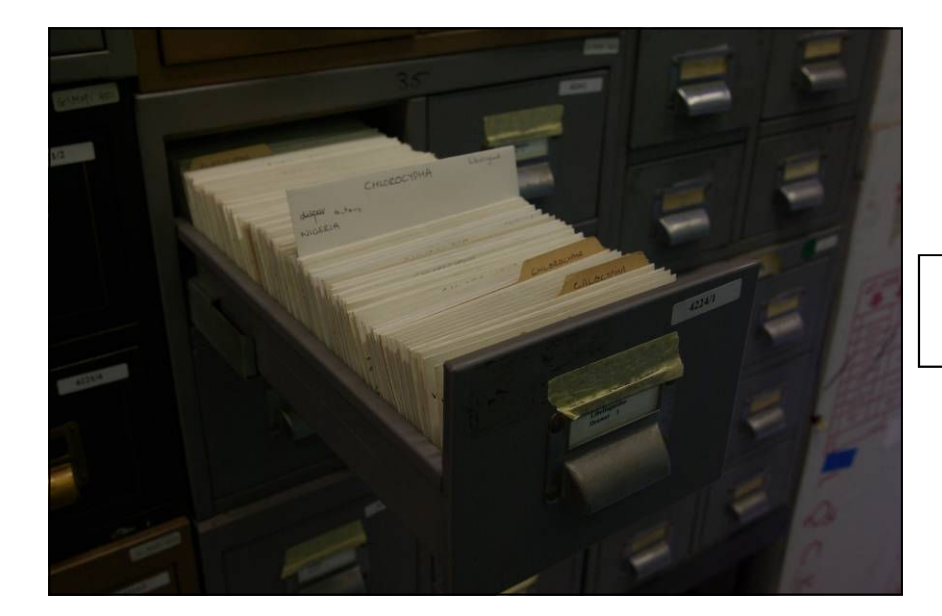
Fig. 2. Odonata papered collection in index card files.

are made of 1.25mm thick non-static, chemically inert, Polypropylene plastic envelopes 153 mm x 82 mm. (product number 1130DP) with supporting carrier backing card of Perma/Dur® Folder Stock from Preservation Equipment Ltd. We buy sheets of 406 x 508mm of the latter (Product number 750-1620) and cut these into 120 x 80mm rectangles to fit the envelopes. Label paper used is 100% rag from BioQuip with printed script using a Hewlett Packard 1100 LaserJet printer. Within the envelope we have a sandwich consisting of, from front to back, the specimen, the new label, the backing card and old labels. The heat sealer for the Polypropylene envelopes ensures that no fragments will be lost and we use the model supplied by Preservation Equipment Ltd. We had begun to store these into Archival quality buffered and acid free 1300 gm Perma/Dur® 'postcard storage' boxes from Preservation Equipment Ltd (product number 780-4612) in non pest-proof metal cupboards kept near the main collection but not directly associated with it (Figs 3 & 4).