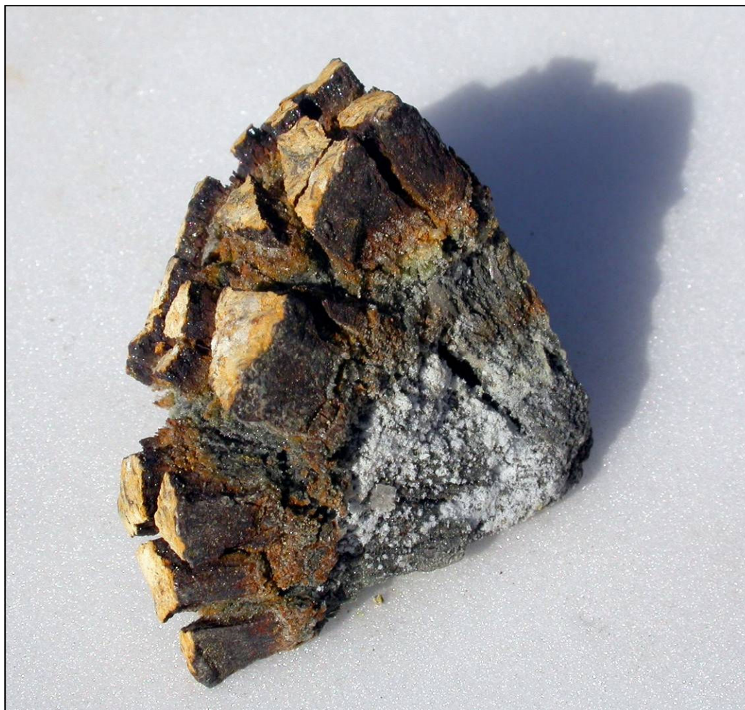
Fig. 4. A fragment (approximately 60 mm across) of a nodule of radiating pyrite after significant pyrite decay. There are two symptoms of pyrite decay in evidence: the white crystalline powder on the internal face to the right of the image, and the deep cracks in the external surface of the specimen, on the left of the image, where sections of the external surface have pulled away from one another as the specimen has expanded.

Importantly, as well as being corrosive the oxidation product is several times the volume of the original mineral. Because pyrite is often present deep inside a specimen the resulting crystal growth and expansion can cause the specimen to fracture (Fig. 4), crumble, and slowly shatter - sometimes catastrophically. Framed and glazed specimens on display that have succumbed to pyrite decay have been known to expand so much that the specimen has pressed against the (non-safety) glazing and forced it to bow outwards. If not detected in time, this could lead to a violent shattering of the glass in a public exhibition space (Cornish et al. , 1995; Rajan, 1995).