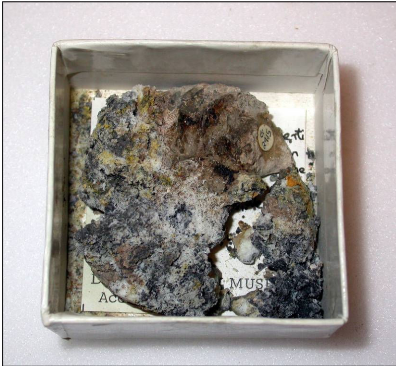
Fig. 2. A small fossilised Jurassic ammonite (approximately 40 mm diameter), preserved partly in pyrite. It has suffered from pyrite oxidation, as evidenced by the mass of grey powder covering it. This dry sulphuric acid or hydrated sulphate has damaged both the specimen and the label, leaving both much weaker and friable. The label states that the specimen has been treated before for pyrite decay, but no details were noted on the label and the specimen has continued to deteriorate – possibly because the storage conditions did not change if the specimen was returned to the same place after treatment. This shows the importance of improving the storage conditions for a specimen after cleaning and/or treatment (i.e. by lowering the RH).

Quite apart from being unsightly and potentially a health hazard the dry, powdery, sulphuric acid and/or hydrated sulphates can be quite deleterious for a specimen. If not seen and dealt with in a timely fashion not only can the whole fossil be destroyed but also the accompanying labels or cards identifying the specimen that has been lost. The storage media – card trays, wooden boxes etc – can also be destroyed in the process, including the base of a wooden drawer and even the specimens in a drawer beneath. This is one of the reasons people used to think it was a ‘disease’ that could spread. In all these instances the sulphuric acid is attacking the cellulose present in the paper, card or wood.