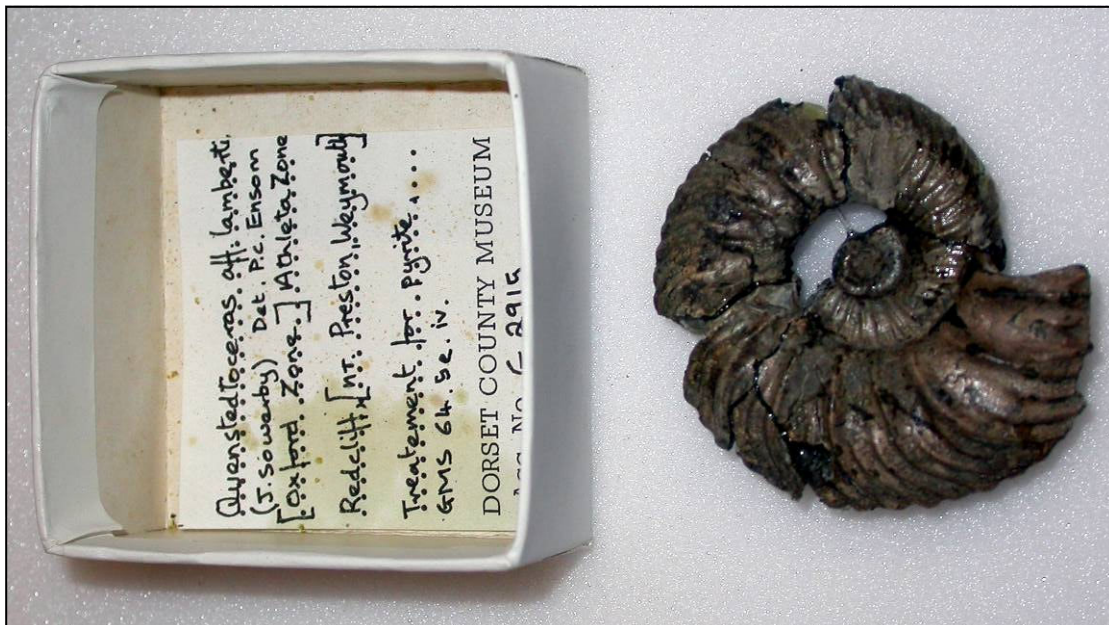
Fig. 3. The same ammonite as in Figure 2 after cleaning and repair.

Quite apart from being unsightly and potentially a health hazard the dry, powdery, sulphuric acid and/or hydrated sulphates can be quite deleterious for a specimen. If not seen and dealt with in a timely fashion not only can the whole fossil be destroyed but also the accompanying labels or cards identifying the specimen that has been lost. The storage media – card trays, wooden boxes etc – can also be destroyed in the process, including the base of a wooden drawer and even the specimens in a drawer beneath. This is one of the reasons people used to think it was a ‘disease’ that could spread. In all these instances the sulphuric acid is attacking the cellulose present in the paper, card or wood.