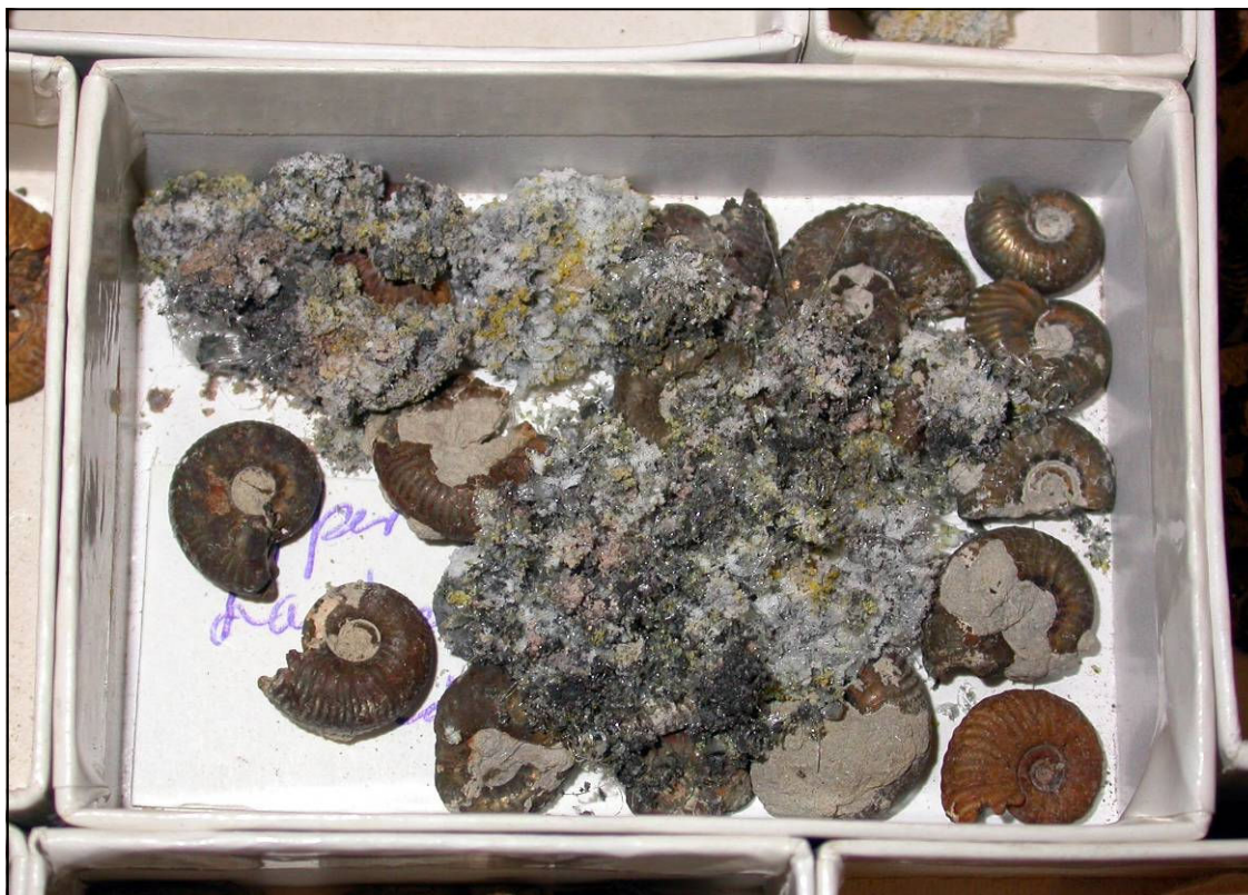
Fig. 1. A card tray (approximately 140 mm long) of small fossilised Jurassic ammonites, preserved partly in pyrite. Many have suffered from pyrite oxidation, as evidenced by the mass of grey and yellow powder covering most of the specimens.

A specimen suffering from pyrite oxidation is often easily identified. Usually it will have lost some surface shine, the surface will develop a crust of white and/or yellow crystals (Figs. 1 & 2), it will begin to smell sulphurous and it may show signs of cracking. Associated labels may exhibit 'scorch marks' (Fig 3). The exact nature of the by-products of the oxidation process will depend on the mineral composition of the fossil and matrix associated with the oxidizing pyrite or marcasite, but are generally sulphuric acid and various hydrated sulphates (e.g., ferrous sulphate, copiapite, fibroferrite or melanterite) (Wang et. al., 1992; Shinya & Bergwall, 2007). Although the symptoms of advanced pyrite oxidation can look terrible at first and specimens can be completely destroyed, it is often the case that careful cleaning and appropriate remedial treatment may save a specimen. The ammonite in Figure 2 looks like it has to be thrown away, but after careful cleaning with a brush followed by some consolidation and gluing it is still a useable specimen (Fig. 3).