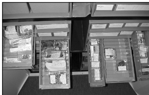
Fig. 3 Storage drawers of mycenoid fungi.

Some myco-pigments are light sensitive or slightly change their chemical composition on drying. Pale hydroids (hedgehog fungi) become mid brown after a few weeks and other genera (cf. Maramiellus ) are similarly affected. The bright red pigment of the Fly Agaric ( Amanita muscaria ) fades to orange.