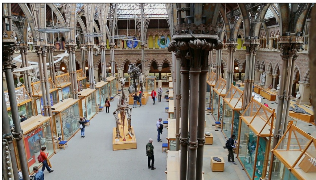
The Oxford University Museum of Natural History, the setting for the first Caring for Natural Science Collections one day conference.