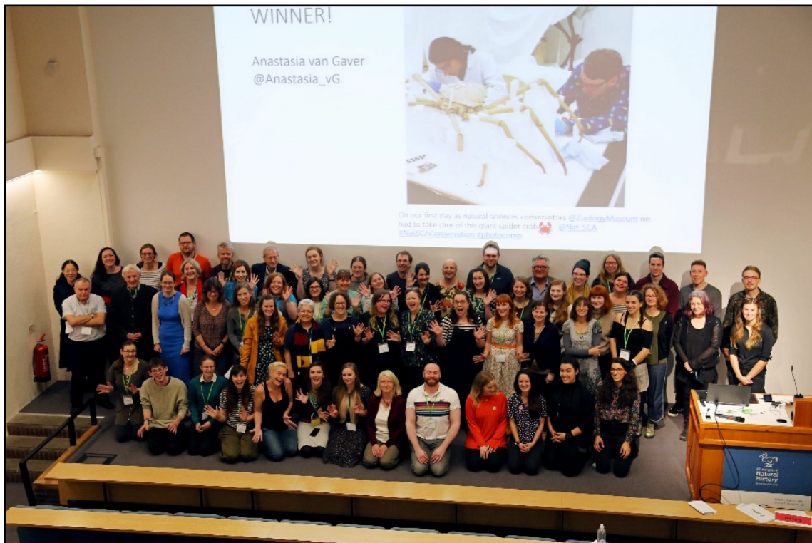
The conference delegates at the Caring for Natural Science conference.

A fascinating talk on Blaschka models which were primarily used as teaching and exhibition models from the late 19 th century was given by The National Museum of Ireland. Paolo spoke about the history and the components of the Blaschka models were explained, highlighting the various media involved such as wood, glass, wax, wool and wire, how each model has different requirements which need to be considered when in storage and on display. Paolo told