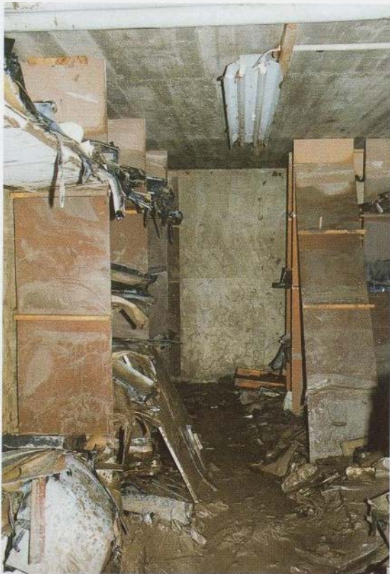
Plate 40 The herbarium hall with broken shelves and disintegrated herbarium boxes (Gerhard Tarmann).