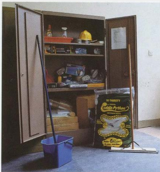
Plate 41 Contents of the Entomology Department's salvage cupboard (The Natural History Museum).